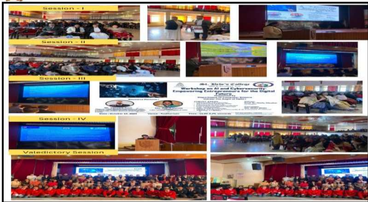
Workshop on AI And Cyber Security: Empowering Entrepreneurs for Digital Future (October 15,2024)